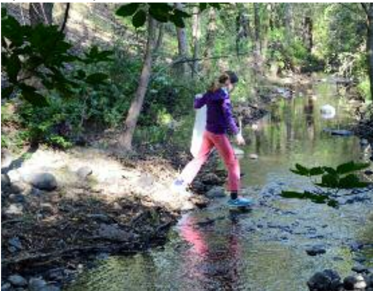
Traversing the creek was all part of the job for some last Saturday.